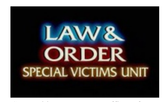
SVU addresses a straw effigy of civil rights

(Jon Schilacci). And as we write, carelessness (and it appears, a great deal of irrational fear) have conspired to bring down two [2] of the largest BL messageboards out there (larger BC[3] discussions[4]). Ironically, Schilacci's former haunt remains one of the only places for fanciers of the Male Youth to congregate. Of course, despite (as it appears) the fact that no site was used to facilitate illegal activity, all remain trading posts for "horrific" KP in the eyes of the media. In other news, Transgressive Resource Center has two[5] domains[6], Norbert de Jonge has been rejected from yet another university[7], and controversy surrounding the "Stockholm Pedophile Preschool Blogger[8]" roars on.