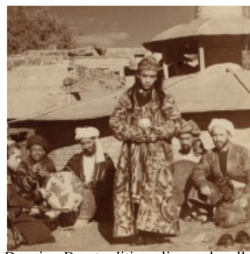
Dancing Boy tradition alive and well in Afghanistan

All stories http://newgon.com/forum/viewforum.php?id=11